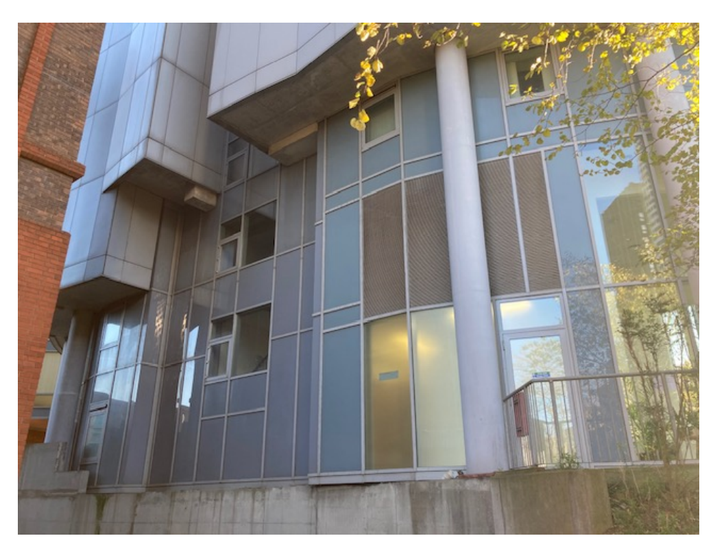
Figure 49a: lower element of Altitude facing Croydon Park Hotel (below floors 3 to 8)

An additional photograph should be added after Figure 49a as below: